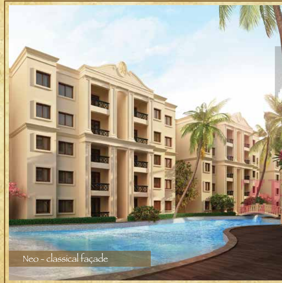
Neo - classical façade

A beach entry pool welcomes you to the palazzo