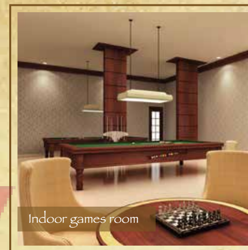
Indoor games room