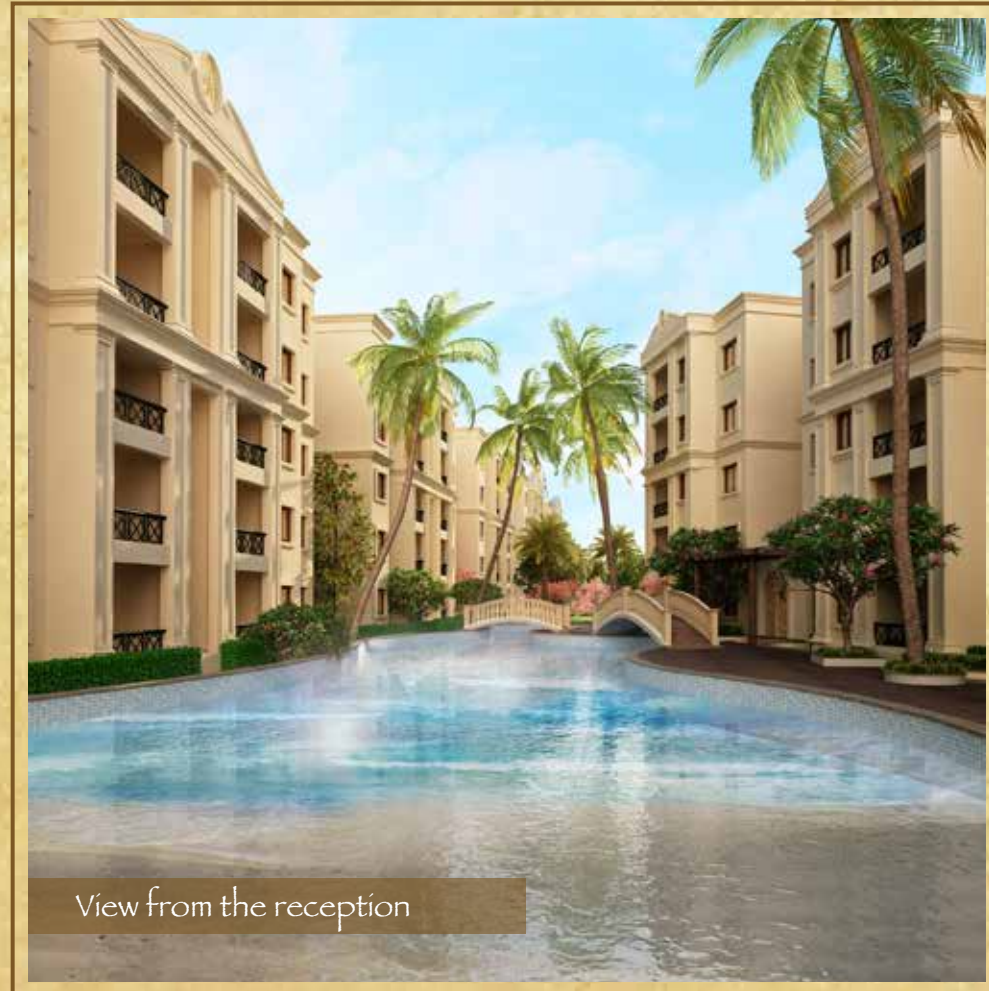
View from the reception

A beach entry pool welcomes you to the palazzo