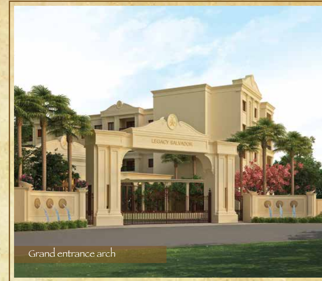
Grand entrance arch

Legacy Salvador takes classic style and reforms it with a contemporary twist to wrap you in luxury and comfort.