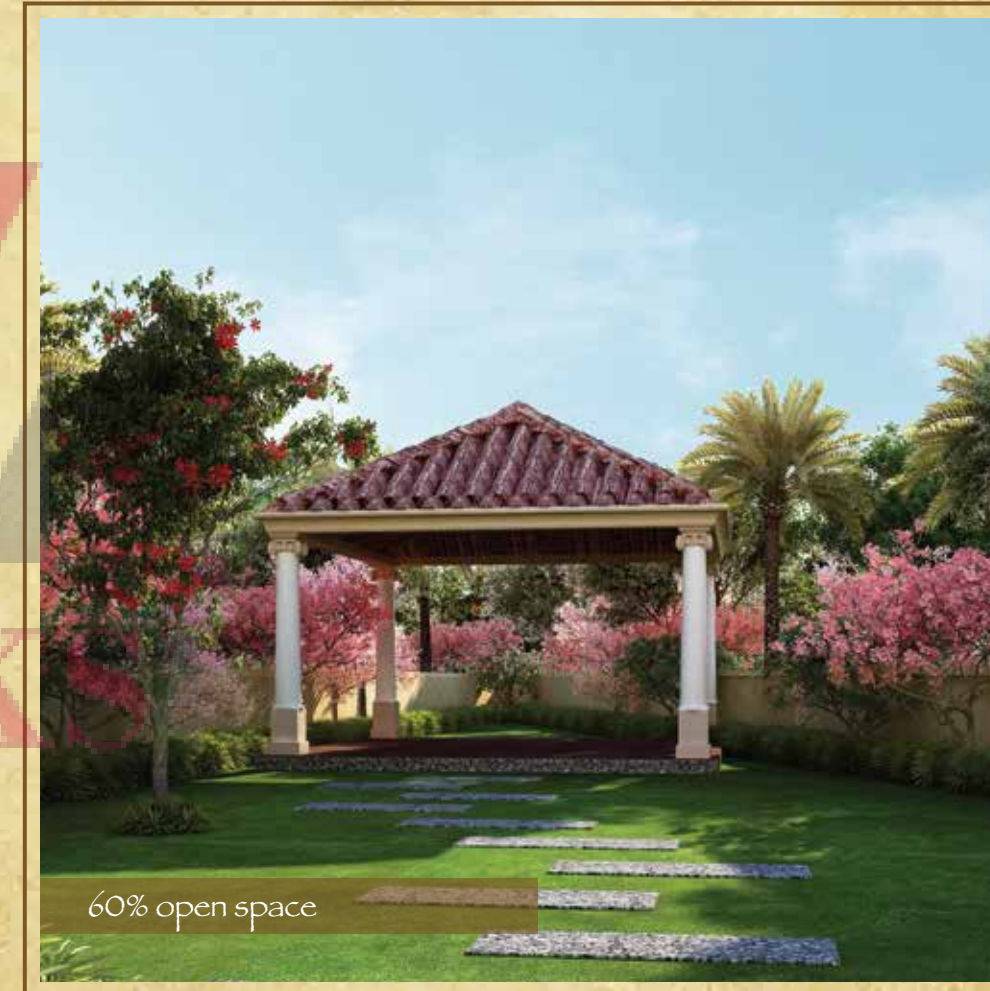
60% open space

A regal neo - classical façade reflecting a love for detail & artistic brilliance